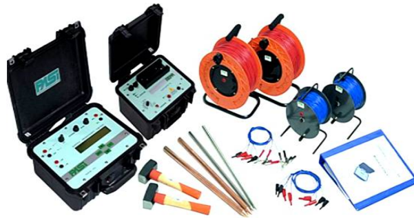
Fig.1 Electrical Resistivity Meter DDR3

Electrical resistivity methods are very much successful in delineating lateral and vertical variation of subsurface geology. Detailed Geophysical investigations with electrical resistivity were carried out with DC resistivity meter IGIS DDR3. It is an indigenous Digital resistivity meter with several innovative features built into its design and is known for its high quality data acquisition capability as well as for its field worthiness.