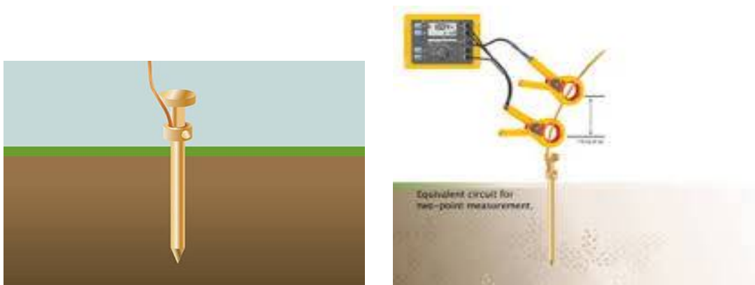
Fig.3 Electrodes for determining potential

In the above electrode arrangement, the two current electrodes are usually designated as C1 and C2, while the two inner electrodes, which pick up the potentials in the ground, are designated as P1 and P2, the potential electrodes or the measuring electrodes as shown in Fig. 3.