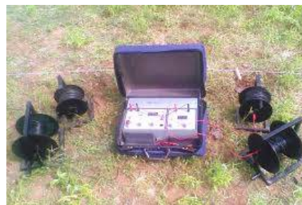
Fig.2 DDR3 analysis

Electrical resistivity methods are very much successful in delineating lateral and vertical variation of subsurface geology. Detailed Geophysical investigations with electrical resistivity were carried out with DC resistivity meter IGIS DDR3. It is an indigenous Digital resistivity meter with several innovative features built into its design and is known for its high quality data acquisition capability as well as for its field worthiness.