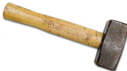
Fig.4 Hammer to hit electrodes